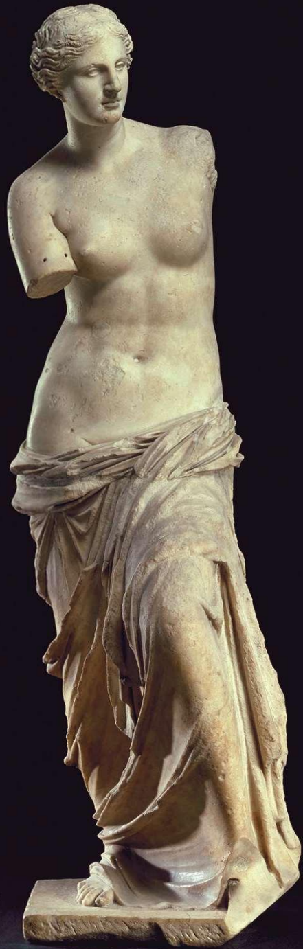
The Venus de Milo