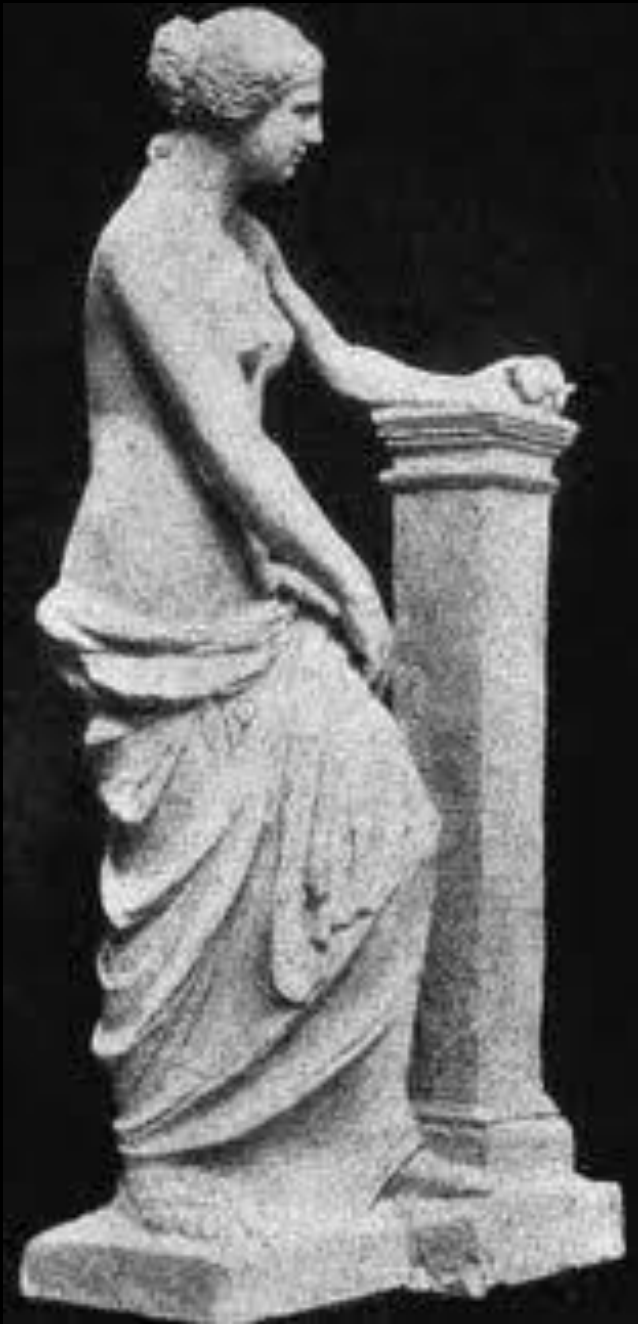
Proposed reconstruction of the Venus de Milo, Adolf Furtwangler