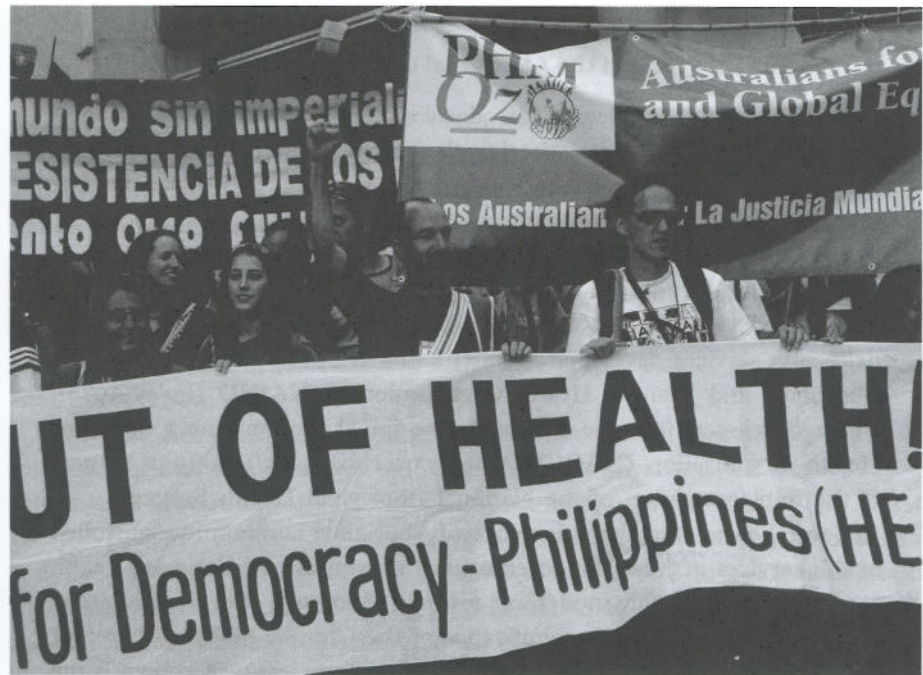
8 Rally for equity in health at People's Health Assembly, Cuenca, Ecuador, 2005

in rural areas compared with 27.7 deaths in urban areas), with rural infant mortality declining further to 23.7 in 2003 (Mehryar et al. 2005).