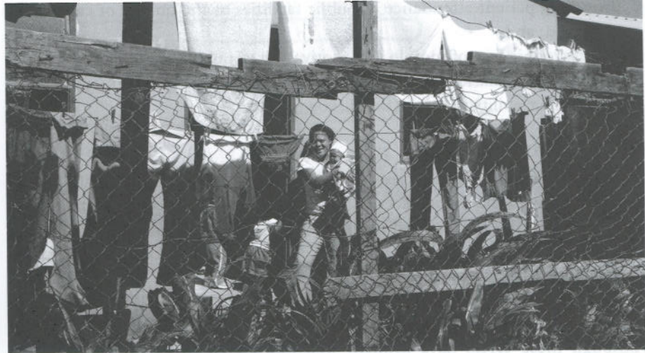
6 Woman in a shanty in Cape Town, South Africa: persisting social and economic inequity in LMICs (Louis Reynolds)